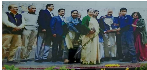
Inter school Urdu Debate competition Running Trophy given by Hon'ble Minister of Education Mr Manish Sisodia.