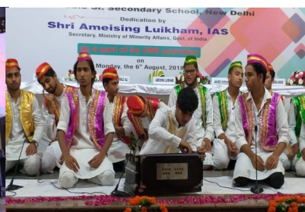
1st Position in Qawali