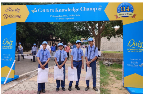
Participation of Our children in Quiz Competition, 400 Schools of Delhi Participated in it.

Published and Printed by Delhi Education Society, Ajmeri Gate, Delhi-110006 Email ID- des.delhi1951@gmail.com, Ph- 011-23216755