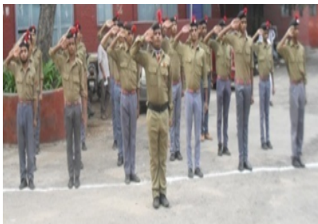
Students of Science Stream of Class XI & XII participated in programme organized by Indian Air Force at Bal Bhawan

The Anglo Arabic School has its origin in Madarsa Ghaziuddin built by Nawab Ghaziuddin Khan, the father of the first Nizam of Hyderabad, Mir Qamaruddin in 1692. The building represents one of the few surviving Mughal Madaras and much of its original design has been preserved. The founder of the Madarsa, Ghaziuddin Khan lies buried in this campus in a beautiful Maqbara(tomb). Anglo Arabic Senior Secondary School is imparting both classical and modern education. This school is a recognized Govt. Aided Muslim Minority Institution where the subjects of all three disciplines namely Science, Commerce and Humanities are taught through English, Hindi, and Urdu medium.