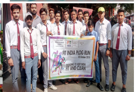
Fit India Plog Run